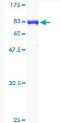
12.5% SDS-PAGE Stained with Coomassie Blue.