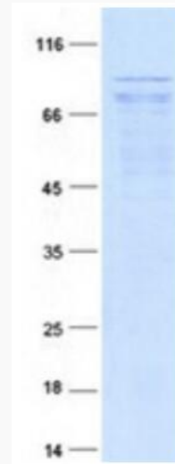
Coomassie blue staining of purified MAPKAP1 protein.