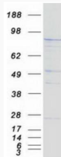
Coomassie blue staining of purified TELO2 protein.