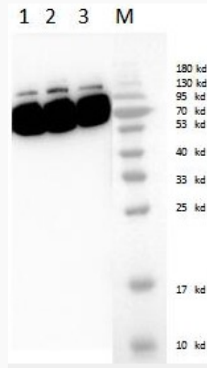
Line 1-3: purified Marmoset TFRC protein